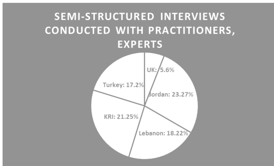
Chart 2: Breakdown of semi-structured interviews conducted with practitioners and experts

A total of 17 interviews were conducted with Syrian teachers, principals, education specialists from international and Turkish NGOs, and UN agencies. Purposive sampling was used to identify interviewees. Organisations that are targeting Syrian refugees between 12-15 years old through formal or non-formal educational interventions were contacted for interviews: eight interviews were conducted in Gaziantep, five in Antakya, and four via Skype; informal interviews with Syrian parents and educators were carried out throughout the research period. In addition to the interviews and focus group discussions by the field researcher, the Ministry of National Education, UNICEF, the Presidency of Turks Abroad and Relative Communities, the Gaziantep and Cukurova Universities were interviewed in Ankara.